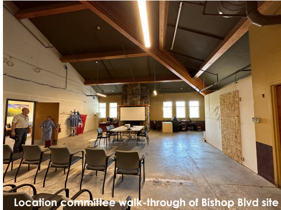
Location committee walk-through of Bishop Blvd site

Working to negotiate a Purchase Sale Agreement for the location on Bishop Blvd.