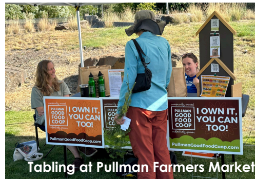
Tabling at Pullman Farmers Market